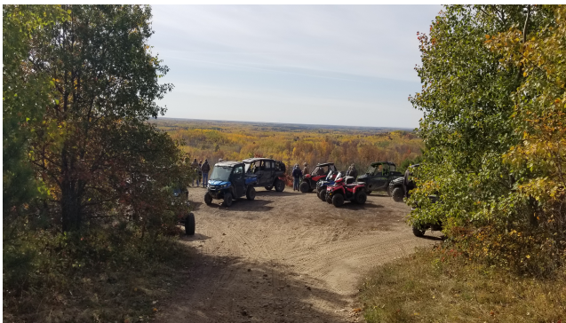
Looking southwest from the Thorpe Tower overlook

The Woodtick Wheelers fall color ride was a hit. There were 10 class II, 4 class 1 machines. 22 members came out on a beautiful sunny October day to ride the Round River Trail system in the Paul Bunyan State Forest. We rode for 4.5 hours, covered 50 miles and ended the day at the Stompin Grounds for a fun get together.