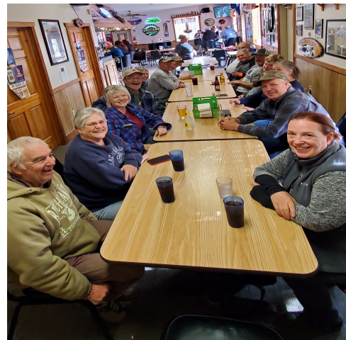
Lunch at the Stompin Grounds