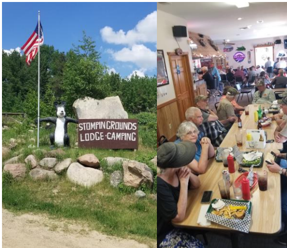
Fun lunch at the STOMPIN GROUNDS