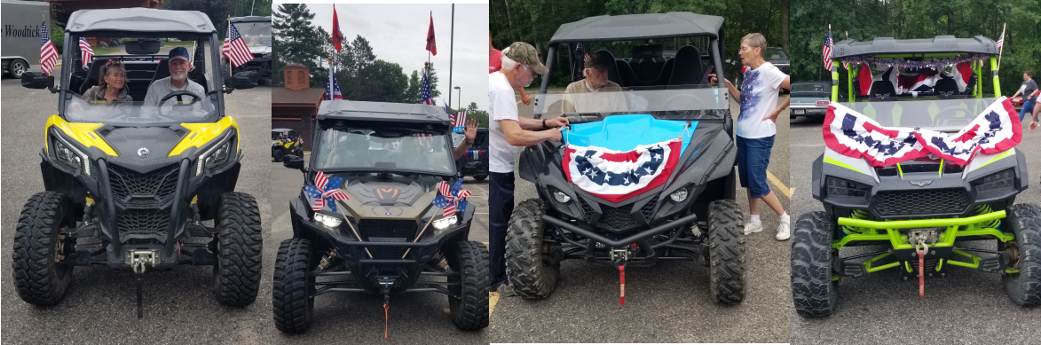
Above - Decorating for the July 4 th Longville Parade