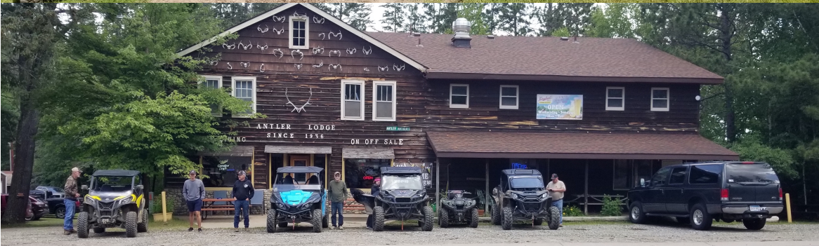
Above - On the Wilderness Trail - Lunch at Antler Lodge