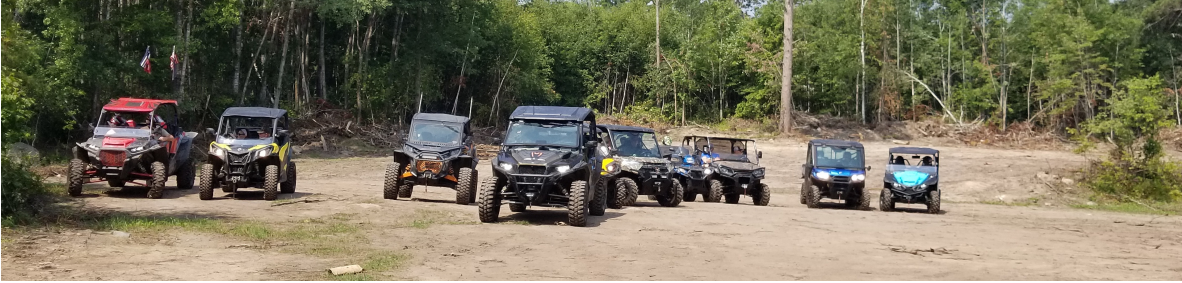
Above Woodtick Wheelers ATV Club July 22 nd 2023 Annual Meeting Saddling up for the club ride – Enjoying the Foothills State Forest