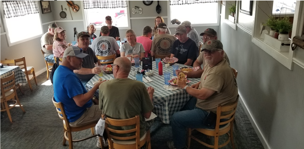
Club members enjoying lunch at The Corner Store Restaurant