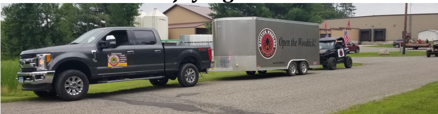
Woodtick Wheelers represented at the Sweetheart Days Parade