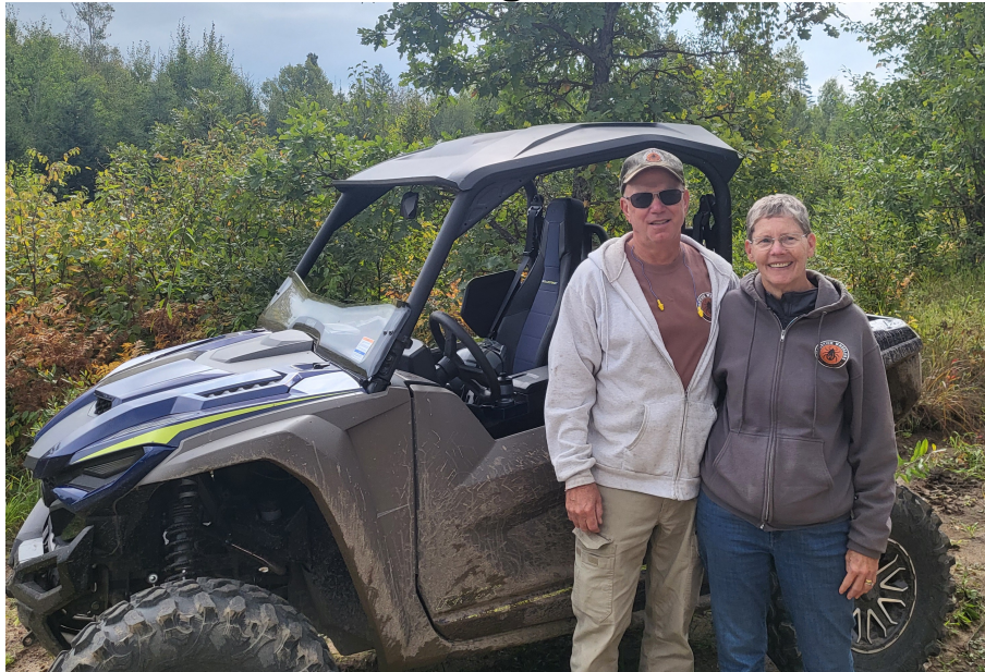
A couple Woodticks enjoying the Schoolcraft Trail.