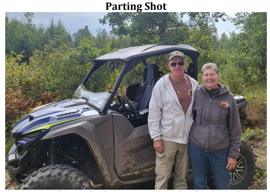
A couple Woodticks enjoying the Schoolcraft Trail.